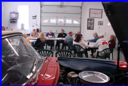
First General Meeting February 2010

The Carolinas Chapter is an affiliate of the national organization, SACC. We are a "probationary chapter" in our first year. Our purpose mirrors our national organization. The Solid Axle Corvette Club (SACC) is a non-profit organization dedicated to the preservation, care, history and enjoyment of the 1953 to 1962 Corvettes. Ours is a family oriented club with membership covering all members of your family. You do not need to own a Corvette to join. The Solid Axle Corvette Club invites you to share our enthusiasm and dedication to the Solid Axle Corvettes and to enjoy the fellowship of our members.